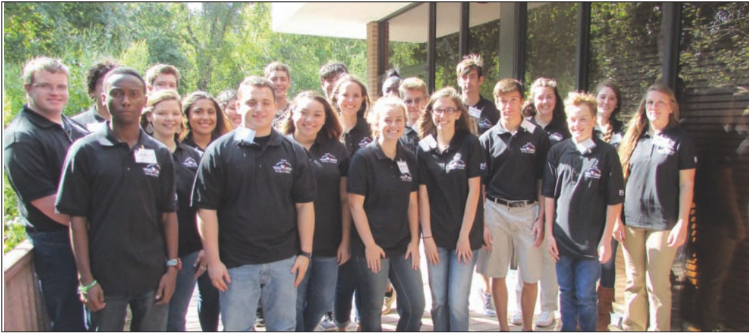
Youth Leadership Class on the Deck @ Chamber