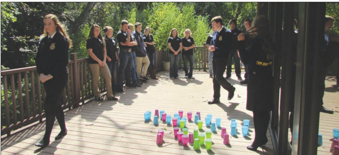
Youth Leadership group participating with FFA Officers