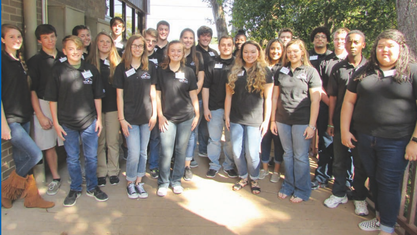
Youth Leadership 2018