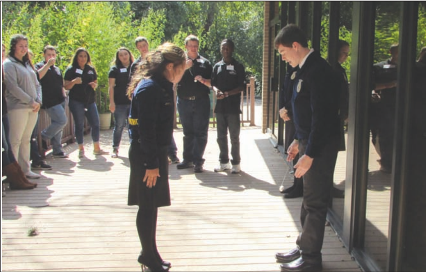
Youth Leadership working in small groups.