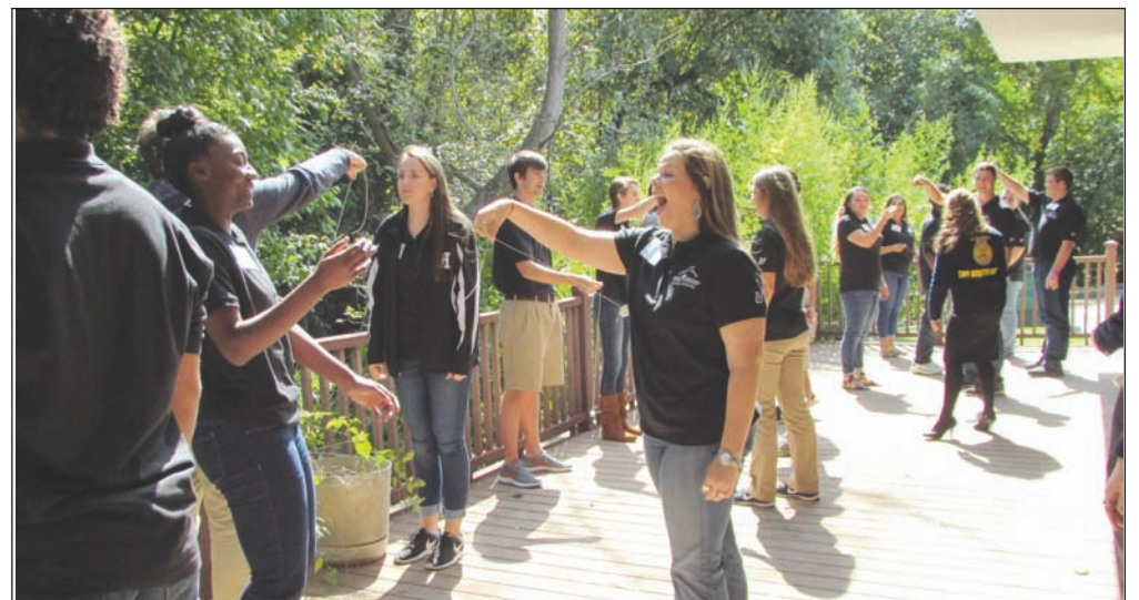
Youth Leadership working on the deck at Chamber