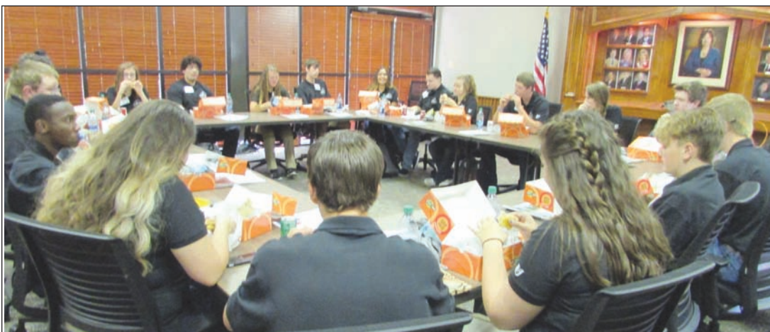
Youth Leadership Class having lunch (Schlotzsky's) at the Chamber