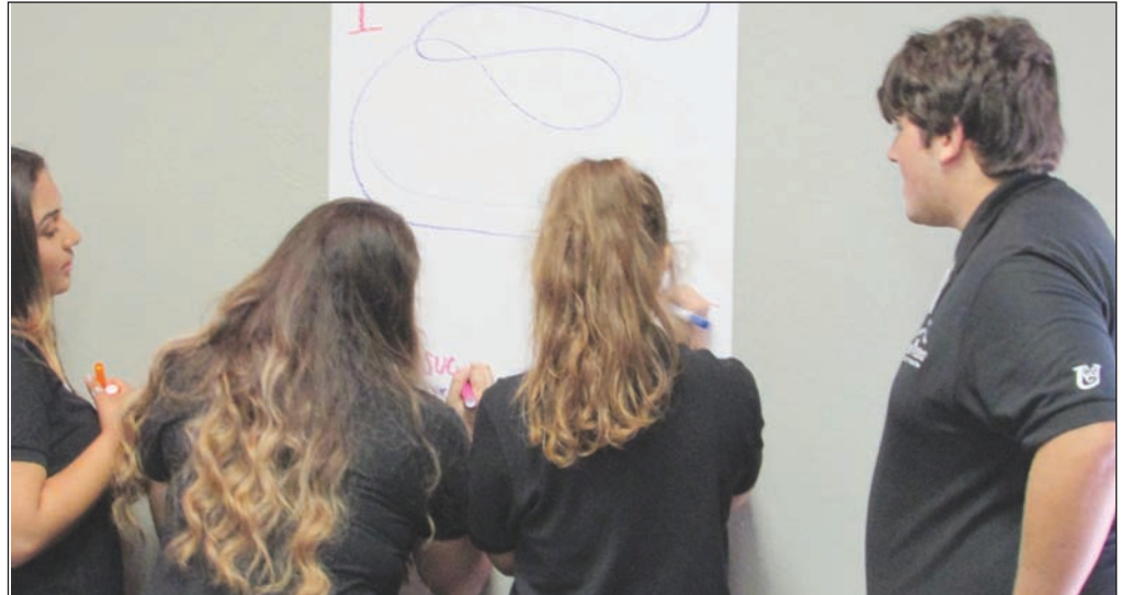
Youth Leadership Group