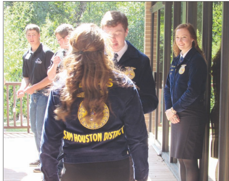
Youth Leadership Class working at the Chamber