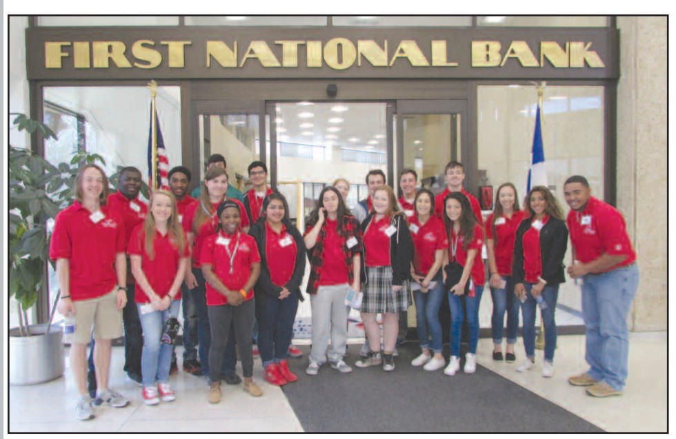
The Youth Leadership visited First National Bank on January 11 to learn about banking, savings and planning for the future.