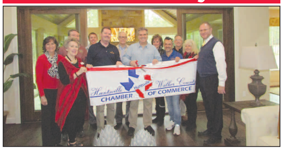
Sierra Classic Custom Homes

Sierra Classic Custom Homes- celebrated their Ribbon Cutting with Chamber Members, and Ambassadors on December 8, 2016. A full-service, custom homebuilder building homes since 1989, they are dedicated to providing customers the tools, knowledge and experience needed to ensure a quality, efficient and enjoyable home building experience. For more information visit SierraClassic.com or stop by their location at 107 Dedication Trail, Huntsville, TX, or you can call them at 936-577-5787.