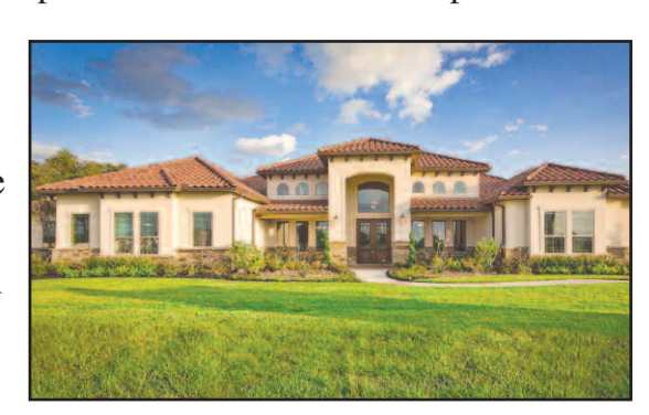
cient, productive Sierra Classic Custom Homes and enjoyable

building your new custom home is a smooth one. We have perfected and streamlined our system to ensure an effi-