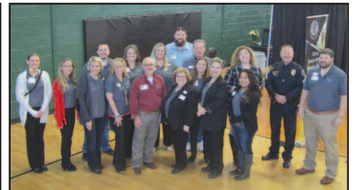
HLI Class 35