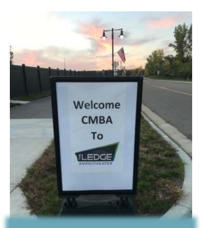
Beautiful morning for an informative meeting