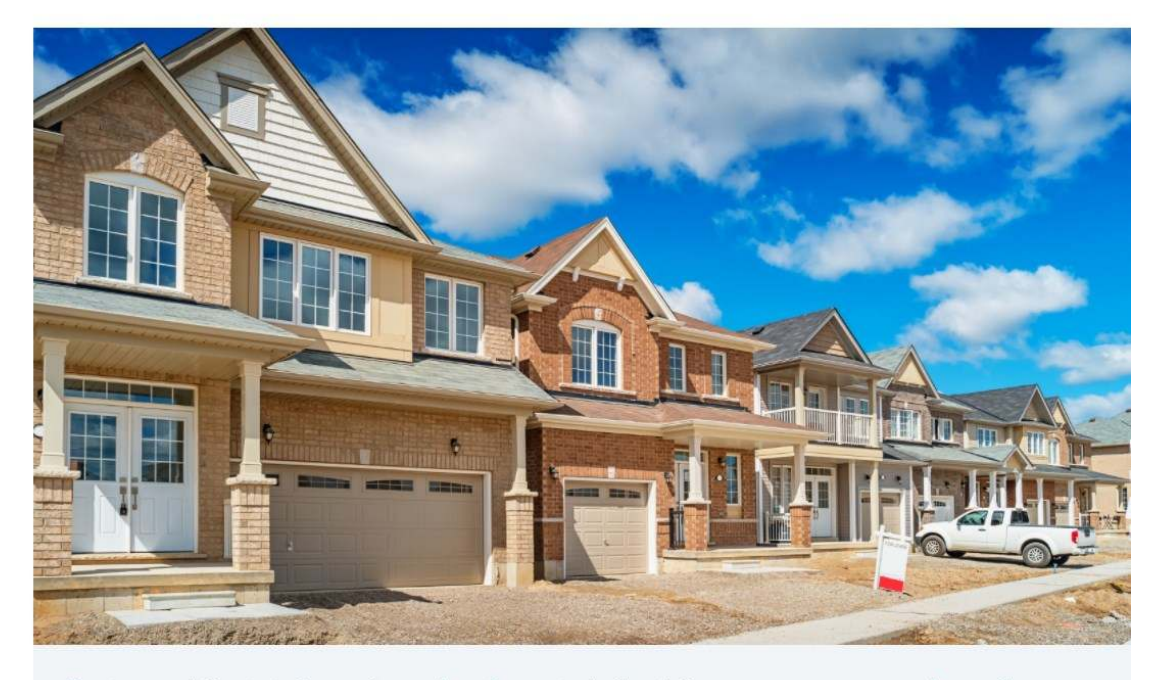
Posting a solid gain in September, sales of new single-family homes rose to an annual rate of 800,000. However, median sales prices also continue to surge because of higher development costs and materials prices.