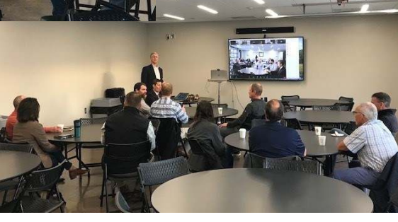
Attendee's at the meeting checking out the stage and audience area, perfect views all around.